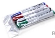
(SETFIXWB) MARKER PENS BOARDMARKER