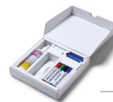
(STARTERKIT) STARTERKIT STARTPACKUNG