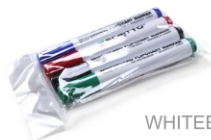
(SETFIXWB) MARKER PENS WHITEBOARDMARKER-SET